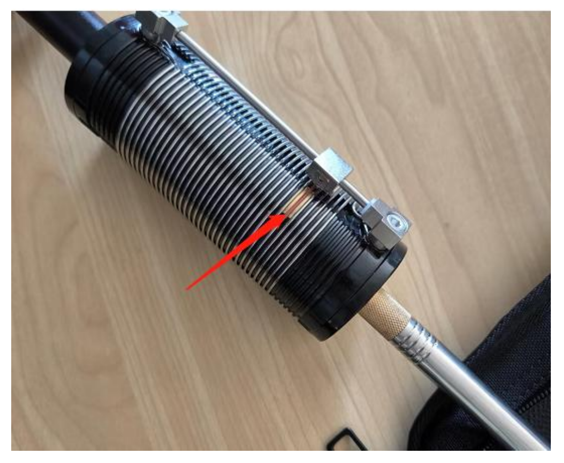
SWR1.1-1.3 (on the red line with the gold mark)

21.4MHZ with 4 sections of aluminum tube + 7 sections of antenna whip+ 10cm, SWR1.1-1.3 29.6MHZ with antenna whip only. extend all and collapse half section, SWR1.2