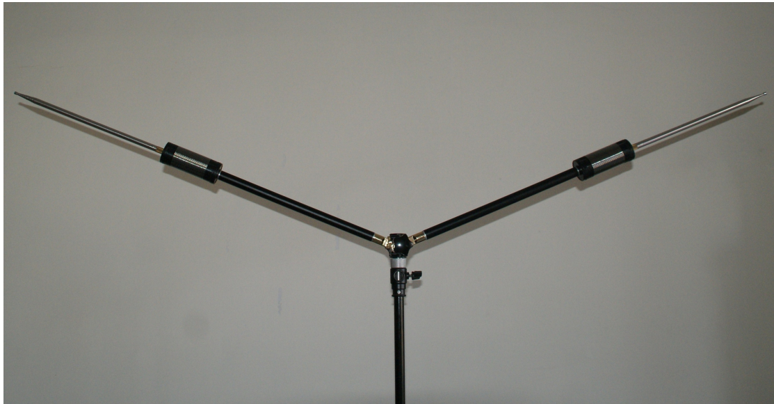
Display of Copper Parts Assembly: